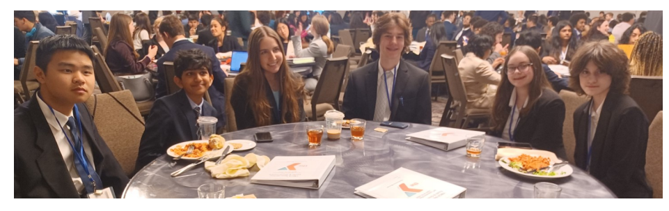
YMCA Honored at 84th Annual Youth and Government Conference